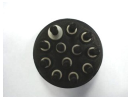
12 x 6mm tube connection OUT